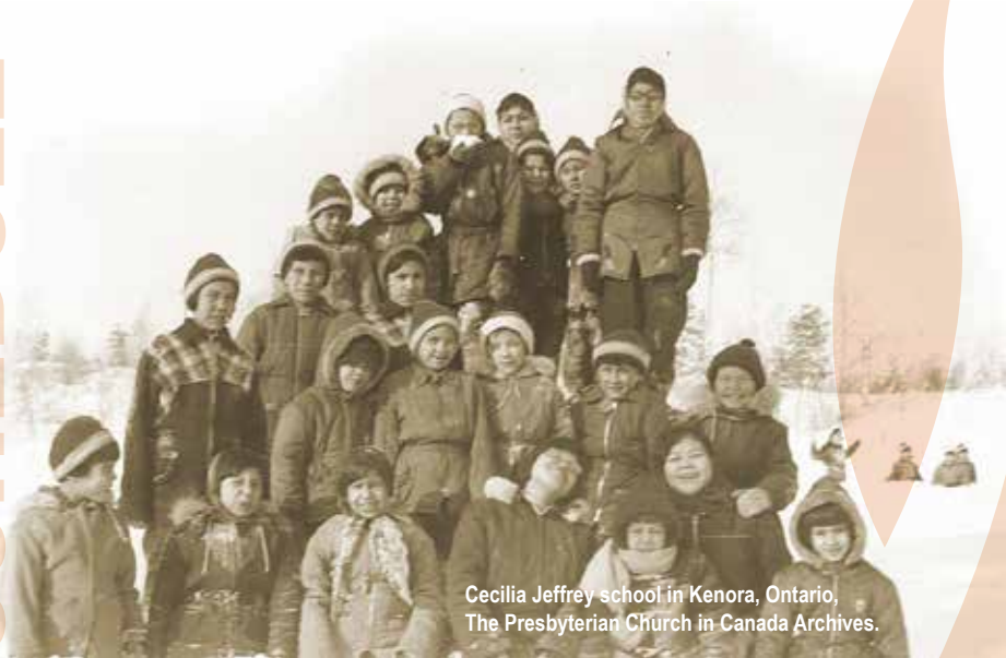
Cecilia Jeffrey school in Kenora, Ontario